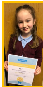
Ruby File (2BP)